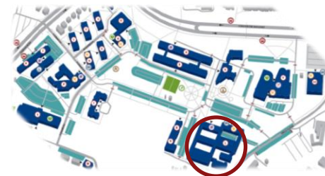
Located in two halls at the Campus